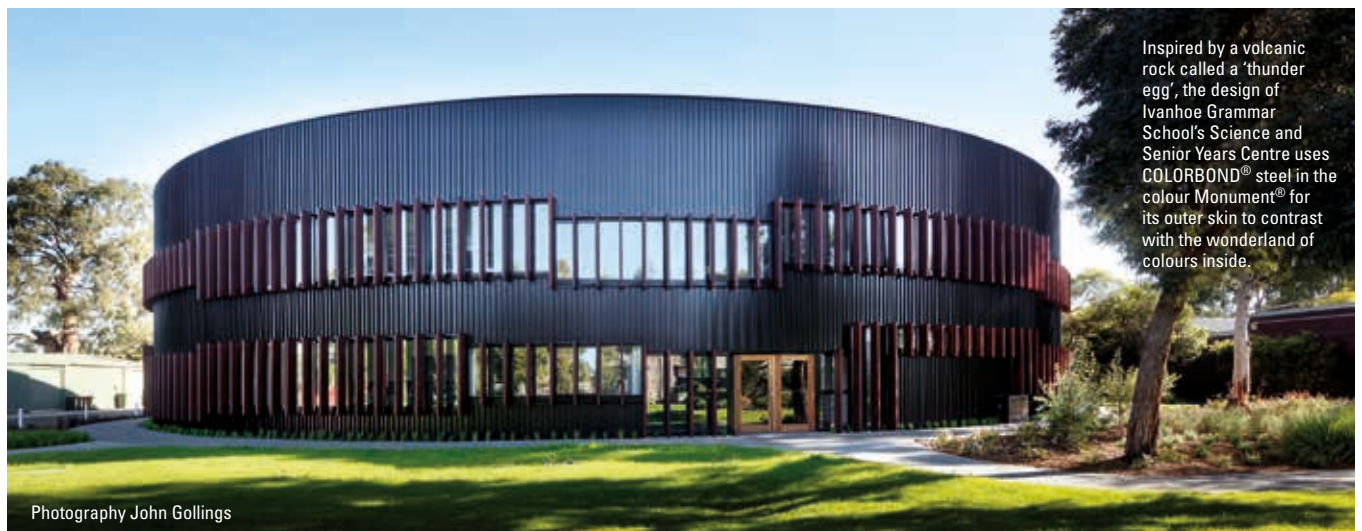
Inspired by a volcanic rock called a 'thunder egg', the design of Ivanhoe Grammar School's Science and Senior Years Centre uses COLORBOND® steel in the colour Monument® for its outer skin to contrast with the wonderland of colours inside.

EPDs are best used to support whole-of-life assessment for end uses such as buildings, infrastructure and their components, as well as everyday materials. Using product-specific EPDs in the context of a whole structure or development enables environmental optimisation and progress towards a better built environment.